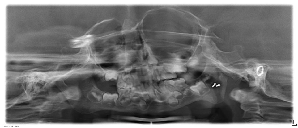
Fig.26. Post-operative OPG