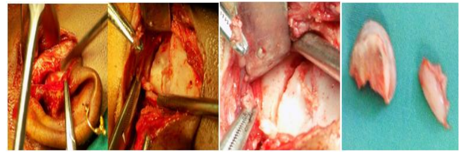
Fig. 12-15. Removal of ankylotic mass